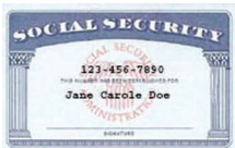
Social Security Card