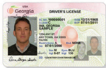
Gov't Issued Photo ID