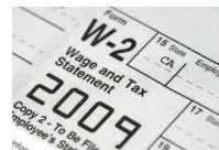
All W-2's for current tax year